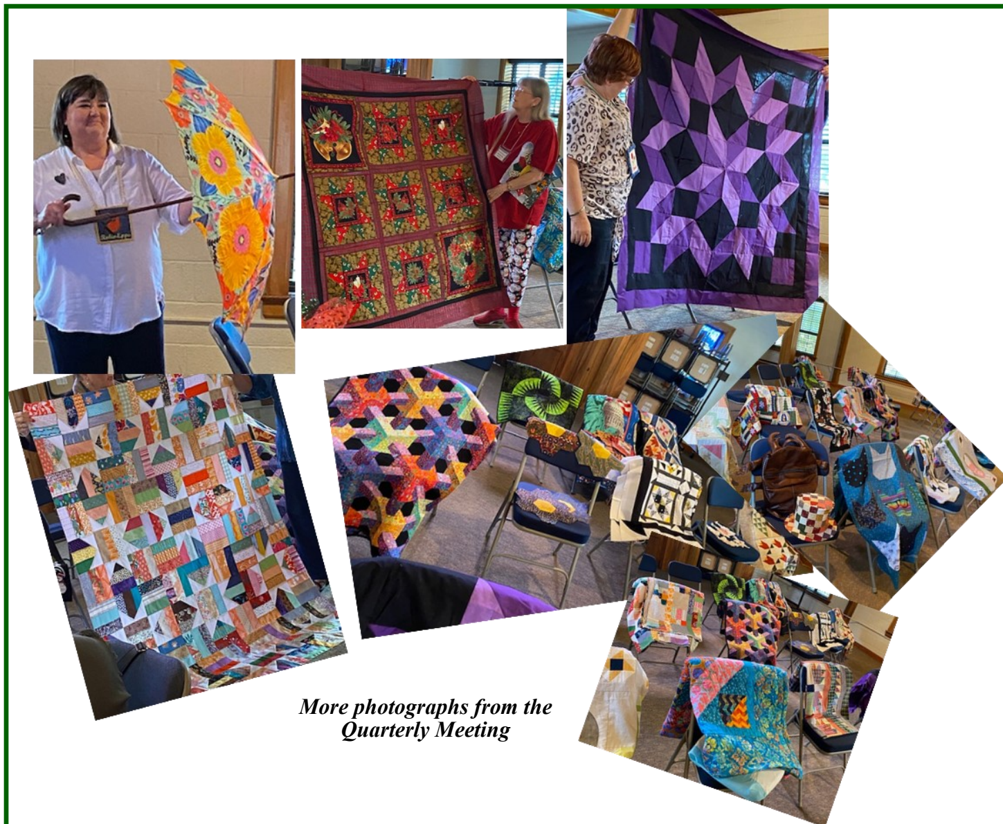
More photographs from the Quarterly Meeting